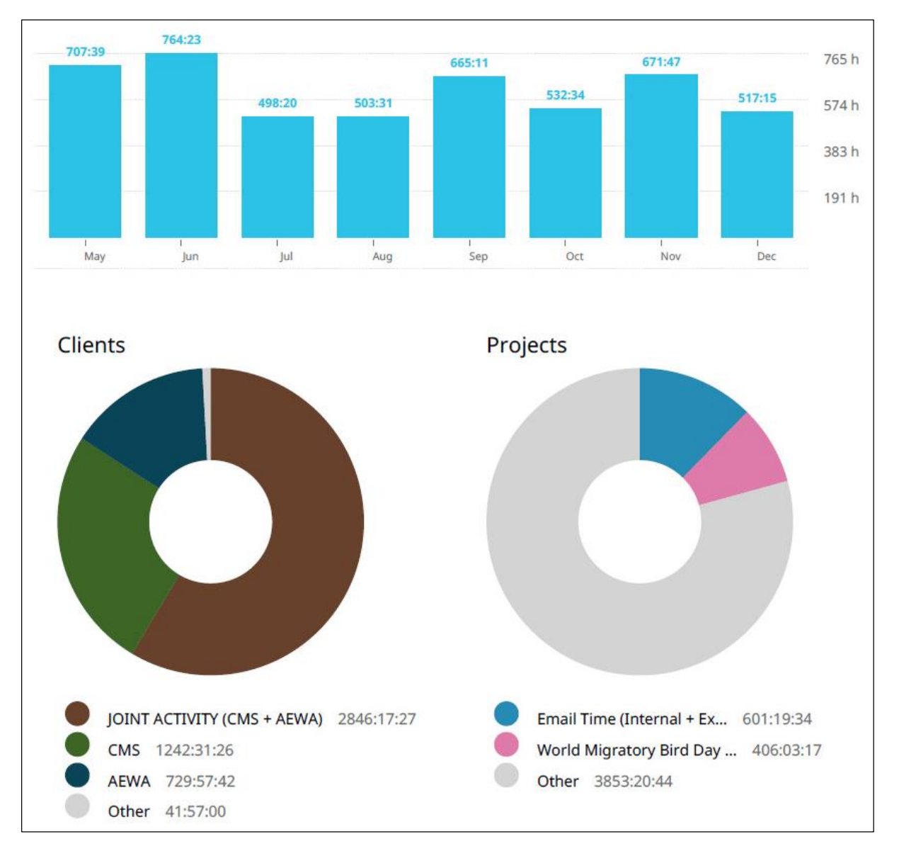
Figure 2: Example Time Tracking per Client Report for IMCA Team for Period of May - December 2016

Below is a sample report which can be produced by the tool being used (<u>www.toggl.com</u>). It shows all the hours logged by five of the IMCA Unit team members grouped by clients (AEWA, CMS and JOINT) over a period of eight months (May – December 2016). It should be noted that this is only an illustration of what is possible with the tool. In future, the time tracking will be done according to the main activities listed in an annual Programme of Work for the IMCA Unit approved by both the CMS and AEWA Executive Secretary (see below).