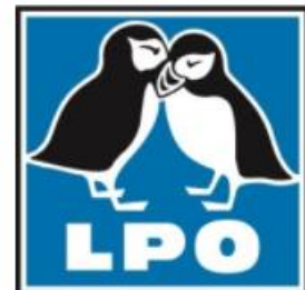
France Clémence Gaudard