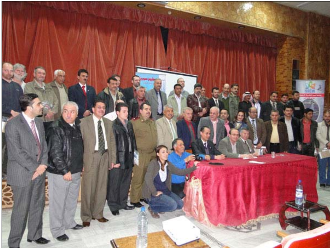
Participants in the Sociable Lapwing workshop held in Deir ez Zor on 26 February 2010. Successful long-term efforts for the conservation of the species in Syria will depend on different stakeholders at different levels working cooperatively together.