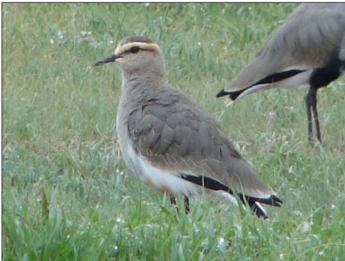
Female Sociable Lapwing near Deir ez Zor, 27 February 2010.