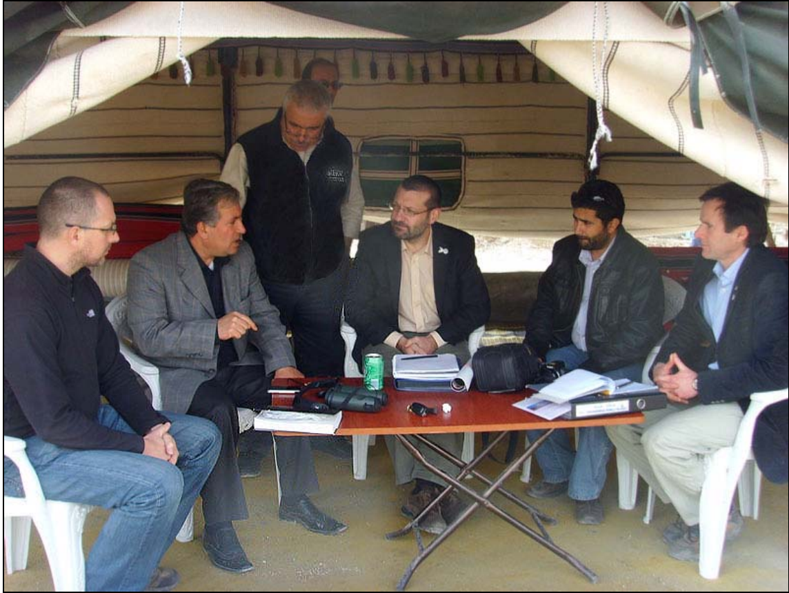
The mission team discusses conservation of Sociable Lapwings in Syria with the General Director of the General Commission for Al Badia Management & Development and the Head of Biodiversity and Protected Areas Directorate of the Ministry of State for Environment Affairs. Palmyra, 25 February 2010.