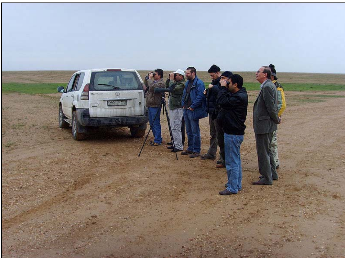
Members of the mission team with Syrian colleagues observing Sociable Lapwings in the field on 27 February 2010.