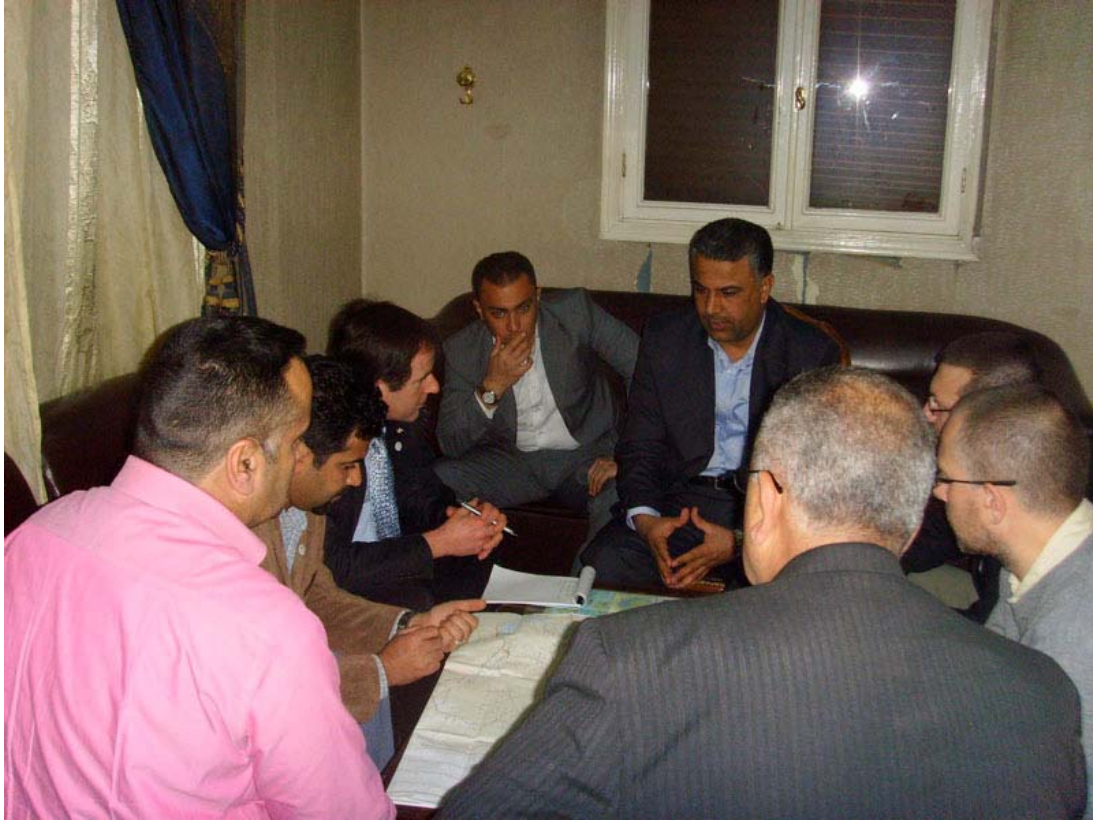
Members of the mission team discussing with stakeholders in Ar Raqqa, including the District Director of the General Commission for Al Badia Management & Development.