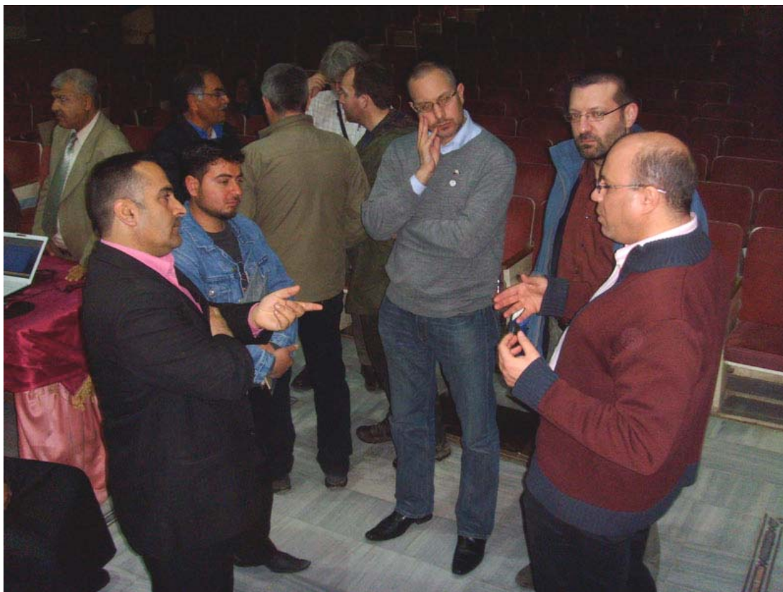
Members of the mission team discuss hunting of Sociable Lapwings with local stakeholders and the General Secretary of SSCW during the Sociable Lapwing conservation workshop held in Deir ez Zor on 26 February 2010.